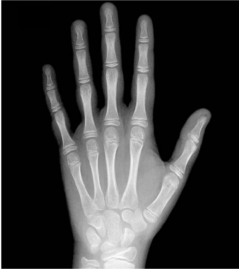
Figure [2.4] : (Gilsanz and Ratib, 2012). Epiphysis of distal and middle phalanges grows faster and embraces the metaphysis before the stage of tinny horn.