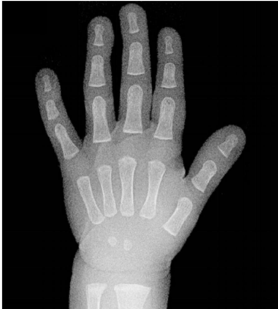
Figure [2.1] : (Gilsanz and Ratib, 2012).

During Infancy, bone age is primarily based on the presence or absence of ossification of the capitate, the hamate and the distal epiphysis of the radius. The capitate usually appears slightly earlier than the hamate, and has a larger ossification center and rounder shape. The distal radial epiphysis appears later.