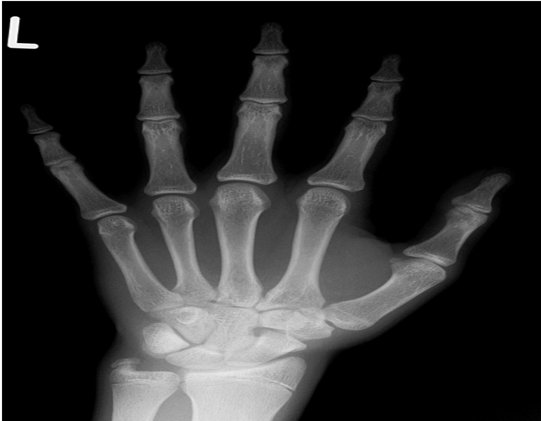
Figure [2.6]: (Gilsanz and Ratib, 2012).