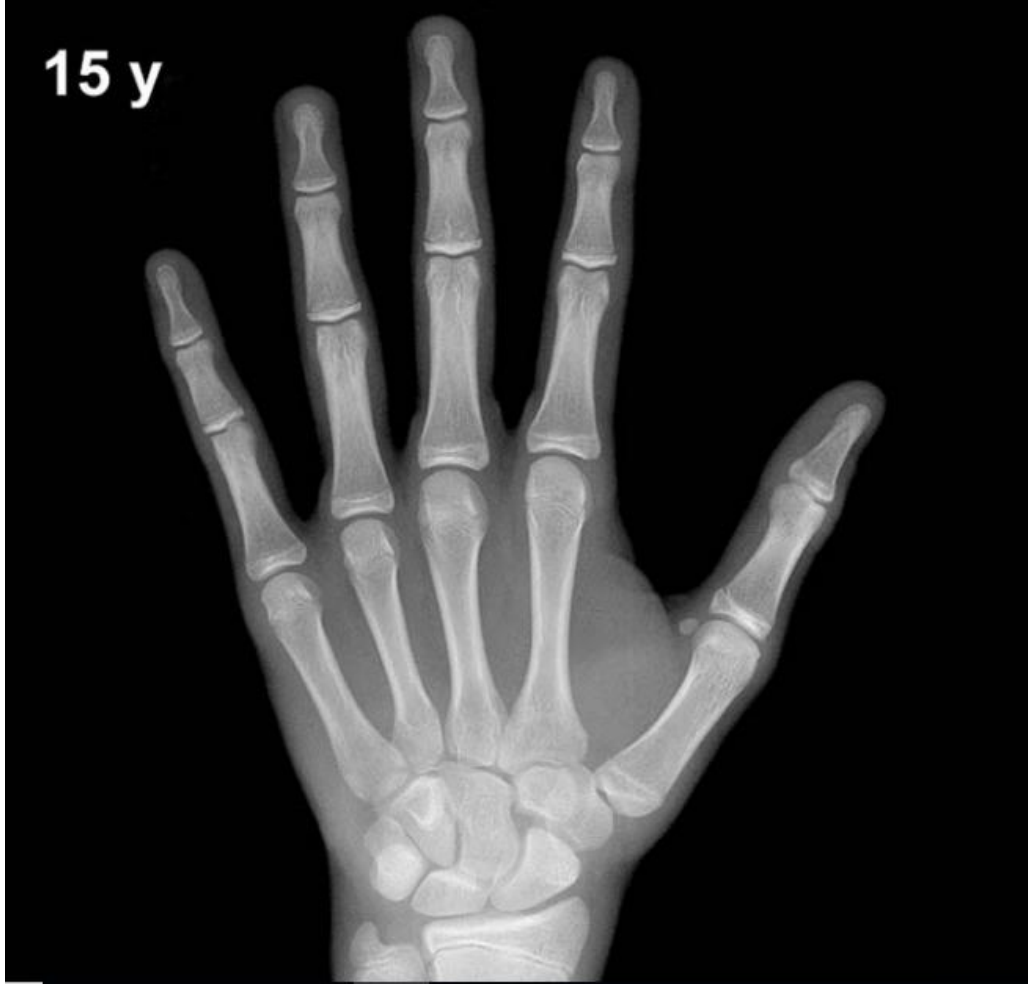
Figure [ 2.5.1] (Gilsanz and Ratib, 2012).

Assessments of bone age in late stages of puberty and sexual maturity are based on the degree of epiphyseal fusion of the distal phalanges (first) and on the degree of fusion of the middle phalanges (second)