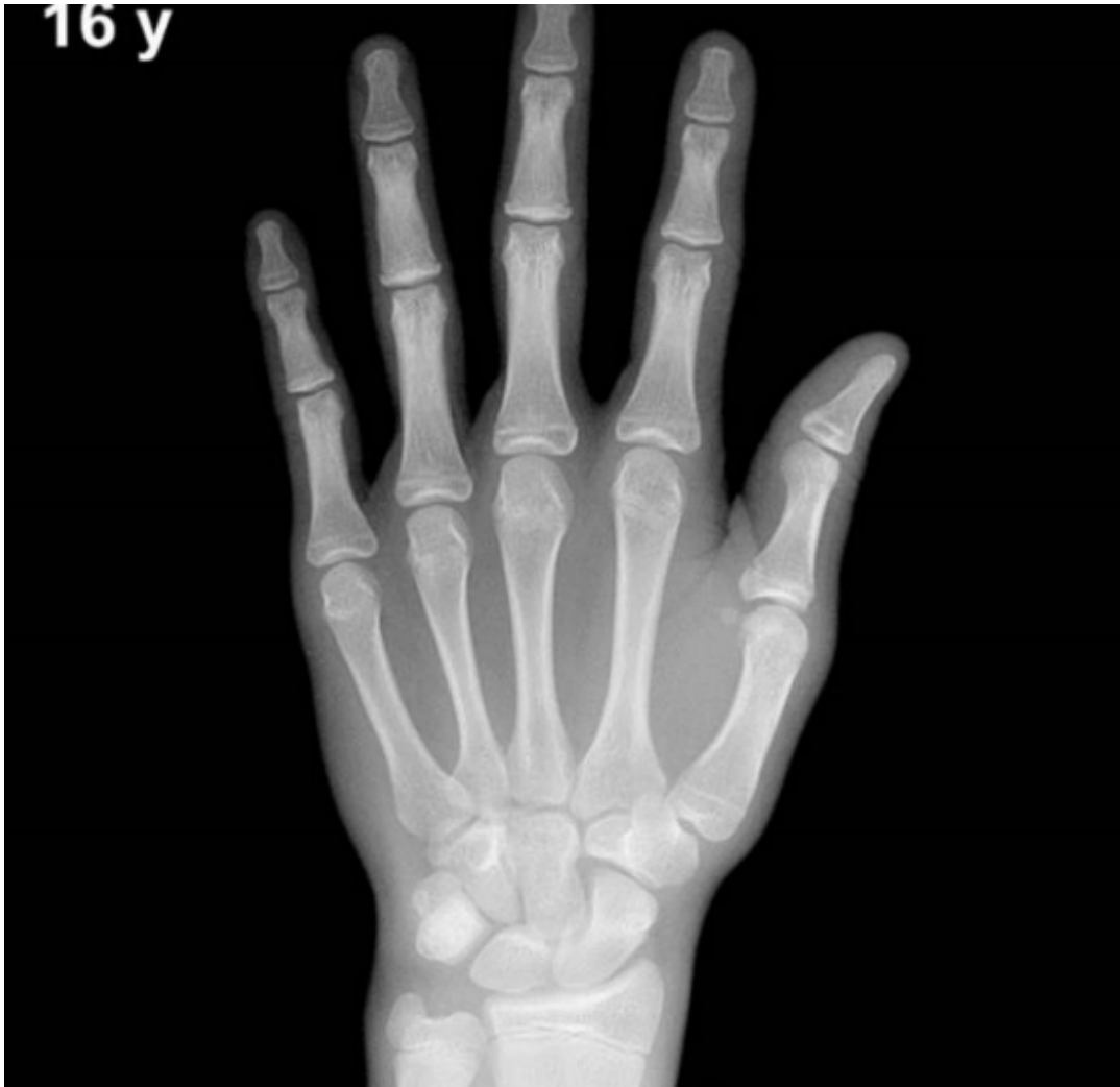
Figure [ 2.5.2] (Gilsanz and Ratib, 2012)

Assessments of bone age in late stages of puberty and sexual maturity are based on the degree of epiphyseal fusion of the distal phalanges (first) and on the degree of fusion of the middle phalanges (second)