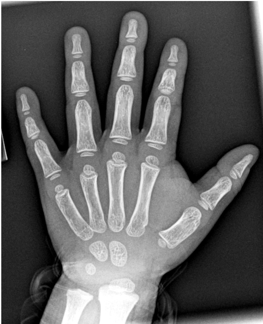
Figure [ 2.2]: (Gilsanz and Ratib, 2012)

Estimation of bone age is subject to recognizable ossification centers of metacarpal bone and phalanges.