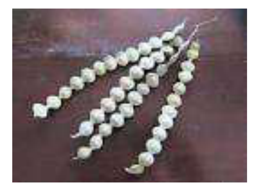
Pods of A. nilotica sub spp nilotica ..