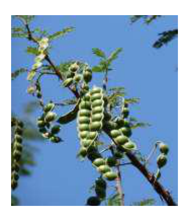
Pods of A.nilotica