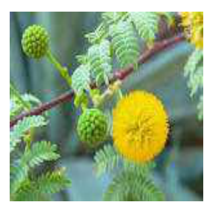
A. nilotica flowers..