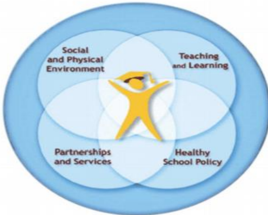
Figure 1. The Pillars of Comprehensive School Health from the Joint Consortium for School Health {39}

The designated first pillar, teaching and learning, applies to a form of student centered learning, combined with teacher training, applying resources, activities, and provincial and territorial curriculums. Knowledge and experiences appropriate to each age level assist students in building skills that improve their health, well-being, and learning {35}